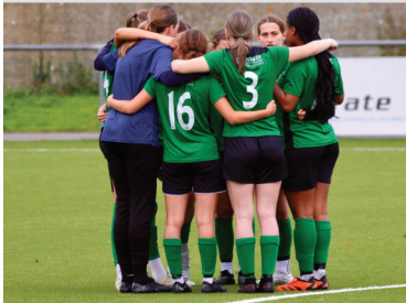
▼ Pre-match huddle - the team's tight knit atmosphere contributes to their success.