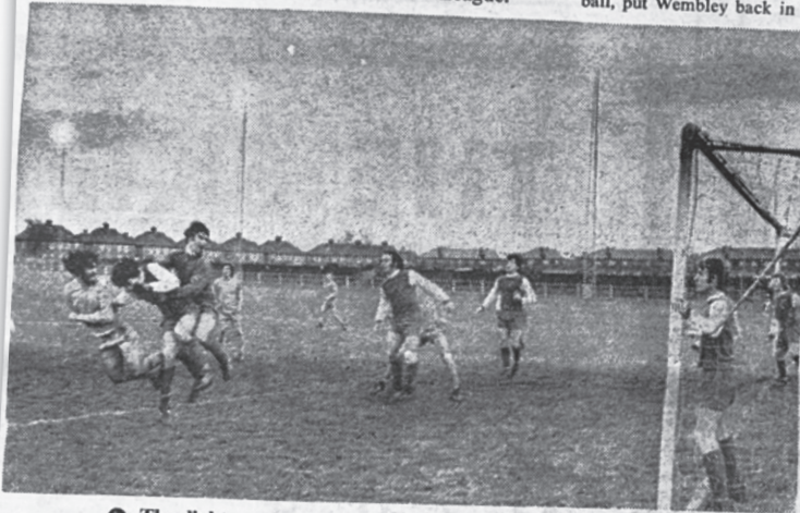
● The lights go on in Haringey's match with Wembley.

The referee, who is on the Football League's books, was criticised after the match for the way he handled the game.