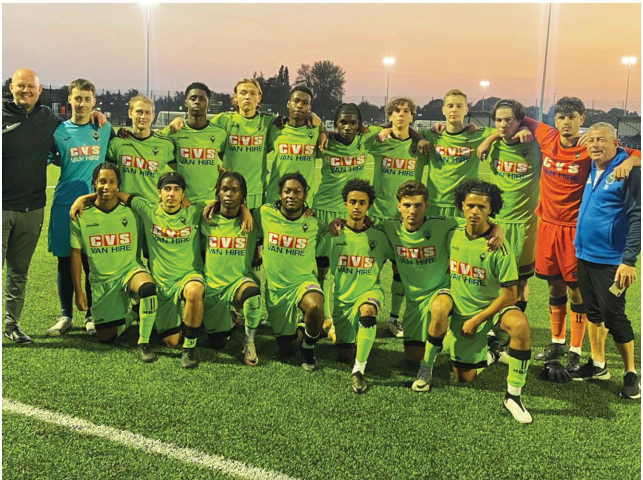
The squad before the May & Baker Eastbrook Community Game